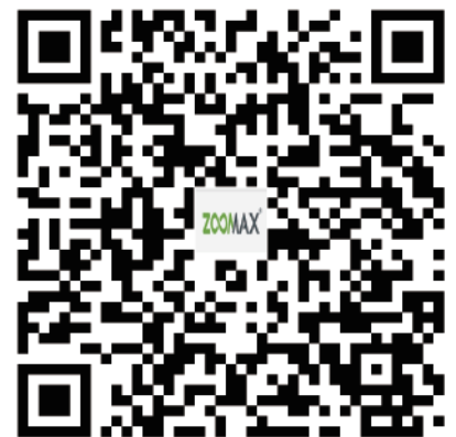
Luna HD 24 Pro